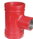
THD Reducing Tee