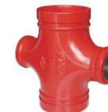
THD Reducing Cross