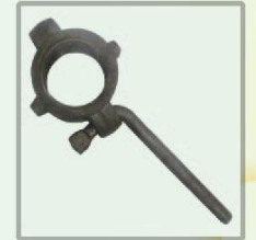
Adjustable Nut 调节螺母 A026 0.80kg