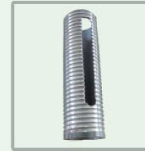
Screw Thread 螺纹管 A015 76x3.5x235mm