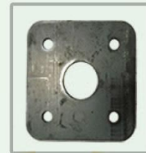
Flat Square Plate 冲压方盘 A032 120x120x4.0mm