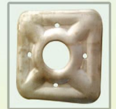
Square type Plate 冲压方盘 A034 120x120x4.0mm