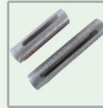
Screw Rolled Thread 挤压螺纹管 A013/A014 60x3.0x210/300mm