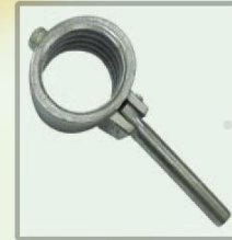
Adjustable Nut 调节螺母 A022 0.45kg