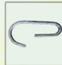
G-pin hook D12/D14 弯销 A043/A044 0.32kg/0.43kg