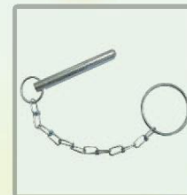
Chain Pin D12 链销 A042 0.12kg