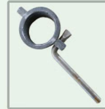
Adjustable Nut 调节螺母 A023 0.45kg