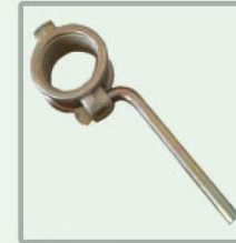
Adjustable Nut D14/D16 调节螺母 A024/A025 0.75kg/1.13kg