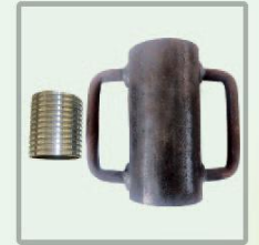
Prop Sleeve 杯式螺母 A021 70X3.5X135mm