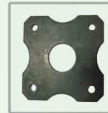
Butterfly type Plate 冲压蝶式盘 A033 120x120x4.0mm