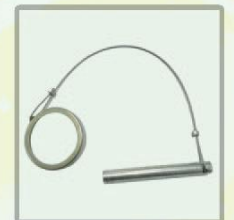
Cap pin D12 盖销 A045 0.13kg