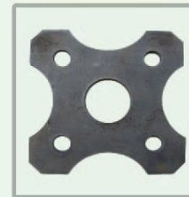
Flower type Plate 冲压花盘 A031 120x120x4.0mm