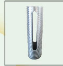
Screw Thread 螺纹管 A011/A012 60x3.0x195/220mm